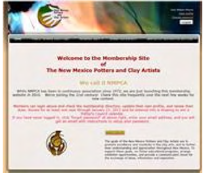
Screen shot of the new Membership Website