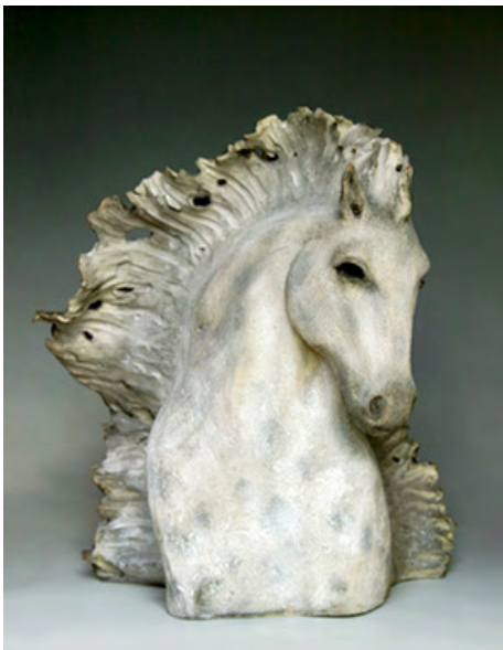
“Wild Horse Zonda”